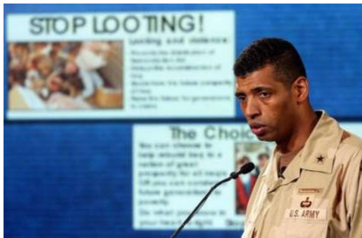
Fig. 5. American pamphlet to stop looting, as exhibited at CENTCOM press conference, April 16, 2003.

inspection” and sober reviewing of “the numbers” contrasted him succinctly from the “gibbering wreck” of a guard and the “hysterical,” sobbing Iraqi curator who could only weep helplessly at the site of her museum’s destruction. 53