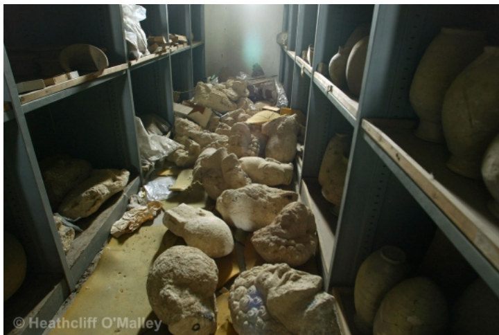
Fig. 4. Widely distributed image of the results of looting at the Iraq National Museum Baghdad, distributed April 16, 2003. Baghdad, Iraq