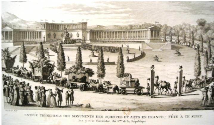
Fig. 1. Fête de la Liberté, 9-10 Thermidor VI, Champs-de-Mars, Paris. Etching, 1798. Reproduced in Patricia Mainardi, “Assuring the Empire of the Future,” Art Journal 48, 2 (1989), 155.

anniversary of the fall of Robespierre, making the objects signify the “triumph over terror.” 12 (Fig. 1)