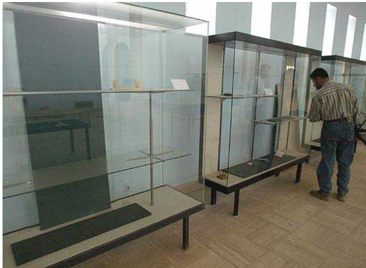
Fig. 3. Less common coverage of the results of looting at the Iraq National Museum, BBC photo, distributed April 18, 2003. Available at BBC .

refined, high-tech behavior: “Witnesses have spoken of seeing well-dressed men with walkie-talkies at the scene, and of artifacts being transported away in orderly convoys of cars rather than over the heads of the crowd.” 47 Clearly, you never just loot. The way you loot tells who you are. (Figs. 3 and 4)