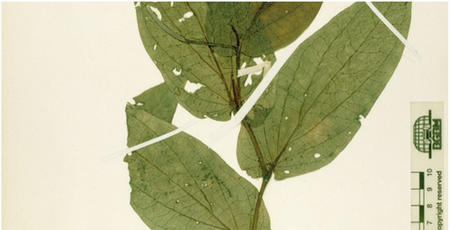
Piper lessertianum (Miq.) C.DC. Virtual Herbarium, https://herbarium.bgbm.org/object/B100256055 .